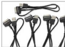
Lightning to USB Cable Kit (10 pack) 97-801 30-pin to USB Cable Kit (10 pack) 97-812