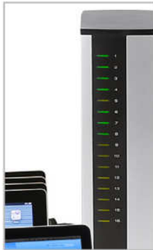
Individual Status Indicator (ISI) LEDs display charging status for all tablets at a glance. Amber light indicates charging is in progress; green indicates devices are fully charged.