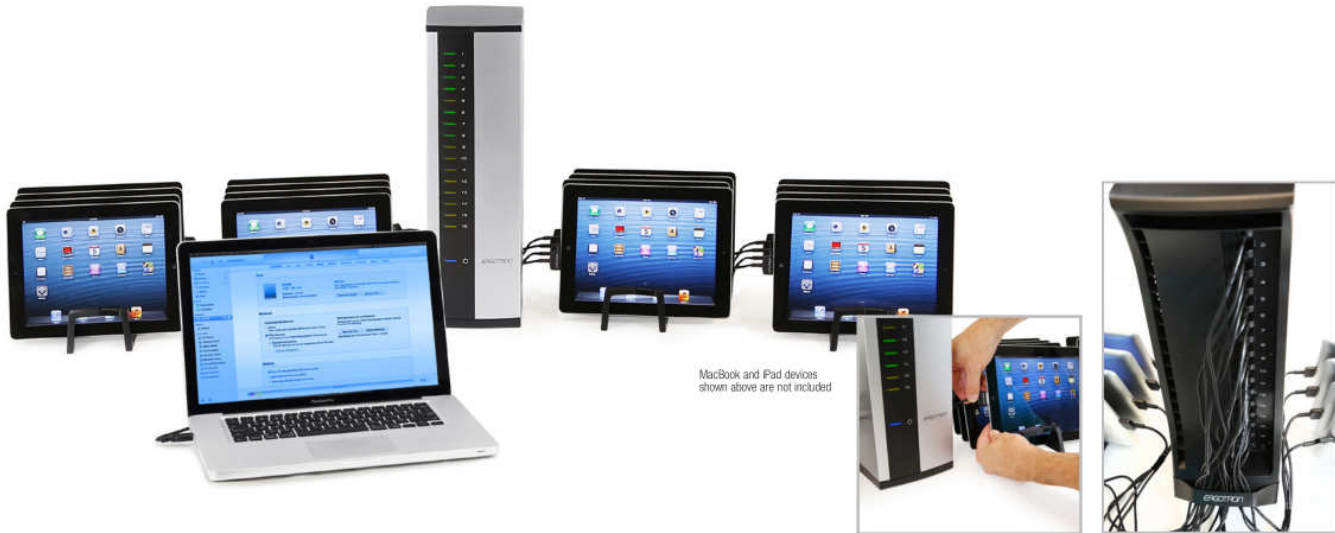
MacBook and iPad devices shown above are not included