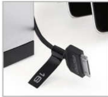
Identification stickers help keep your devices well organized