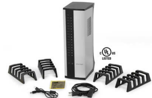
30-Pin or Lightning USB cables attach from each device to a designated slot on the back of the tower