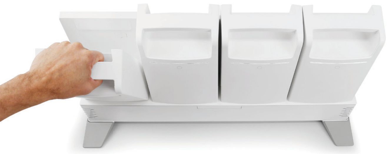
LiFeKinnex 4-Bay Charger (Desktop)