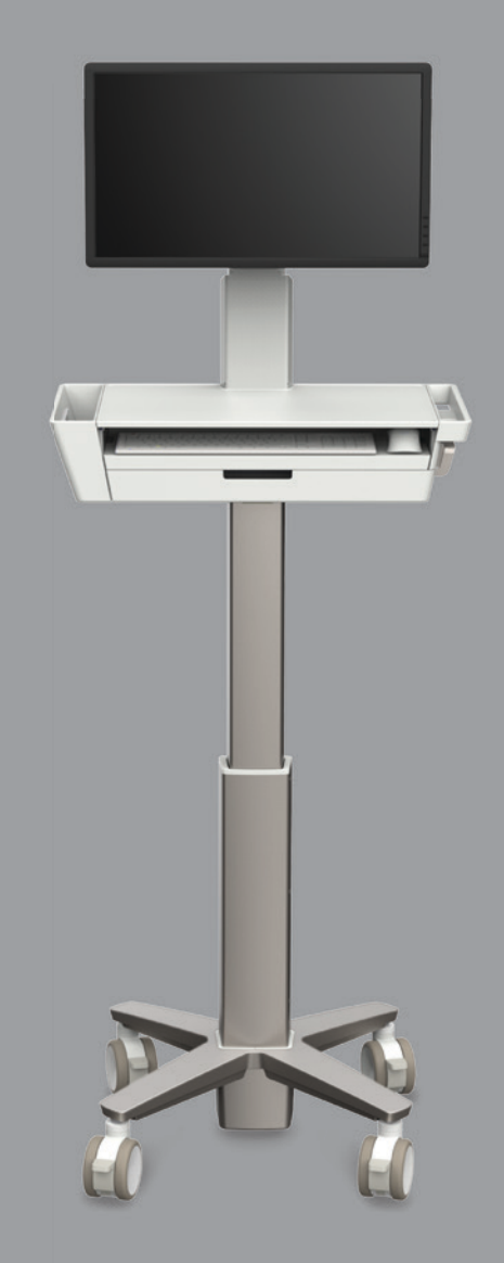
CareFit Slim LCD 2.0